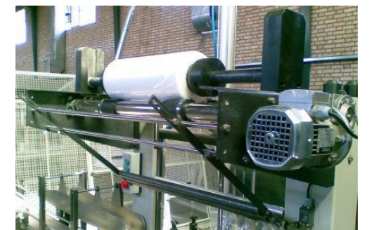
Plastic Cover roll feeding system