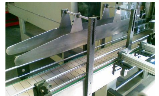
Bottles stainless still dividers