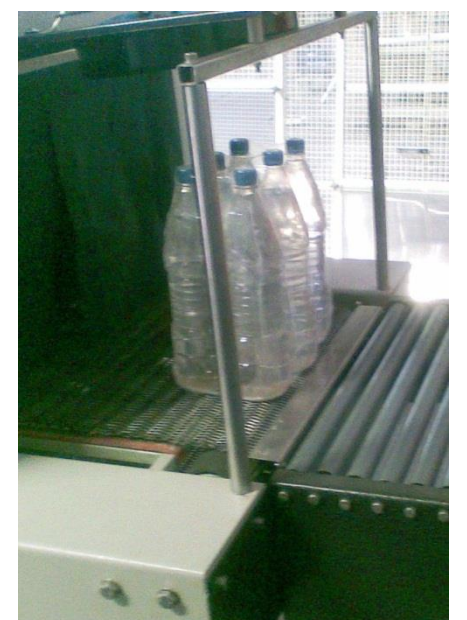
Completed shrink packed package