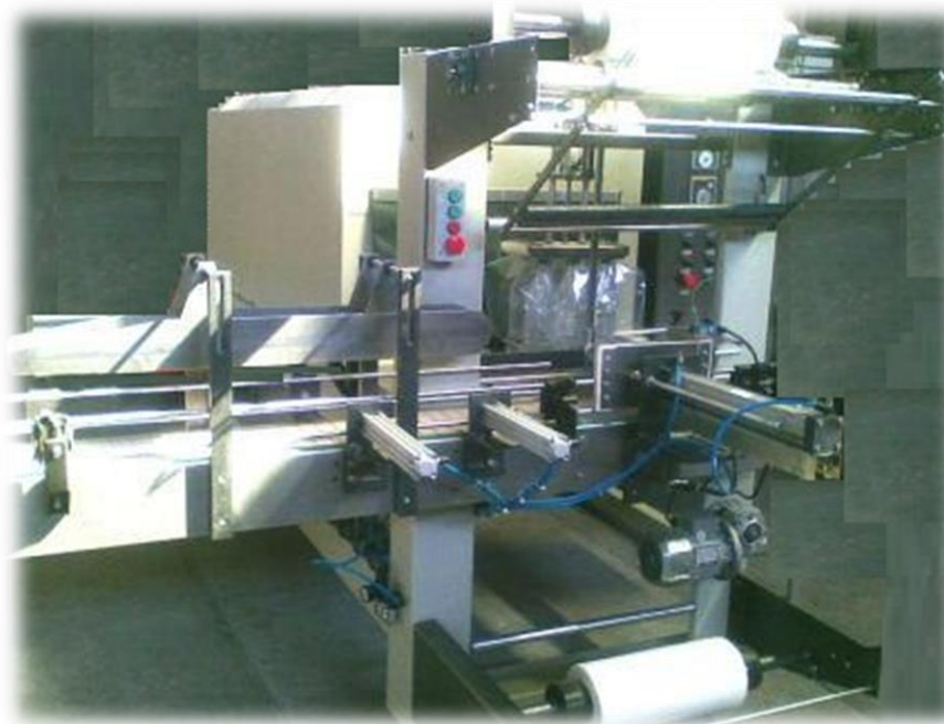
Shrink pack machine equipped with bottles sorting system