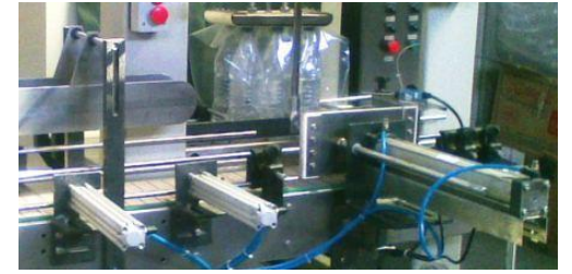
Pneumatic bottles forming system