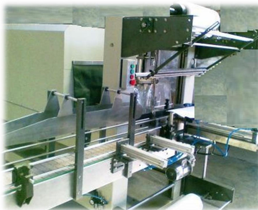
Shrink pack machine equipped with bottles sorting system