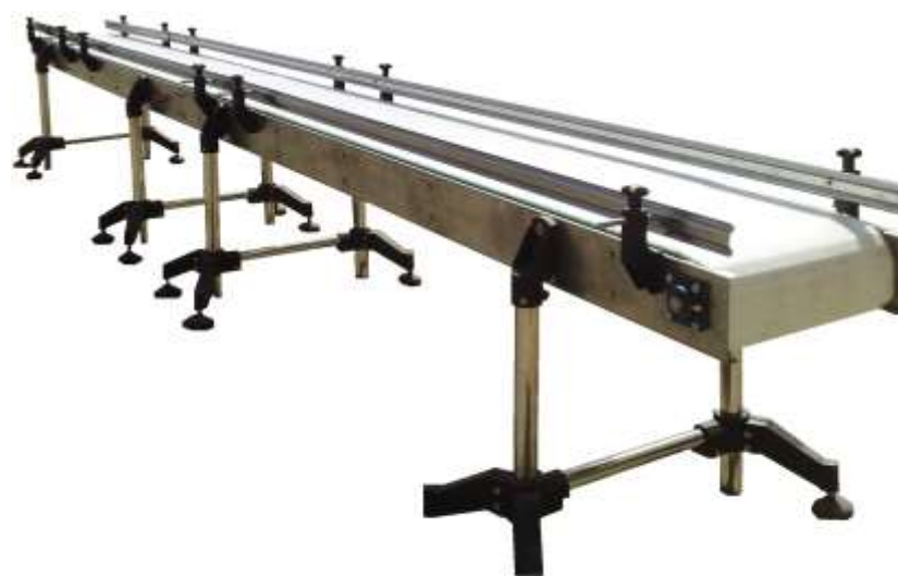
Wide width Conveyor with modular chain