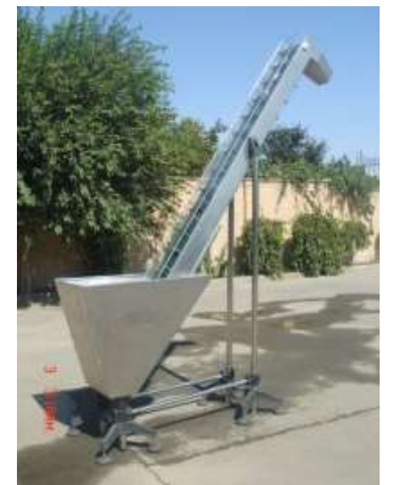
Hopper conveyor with reservoir