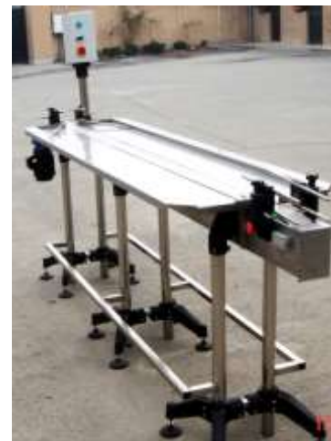
Bottle conveyor & Conveyor equipped with table