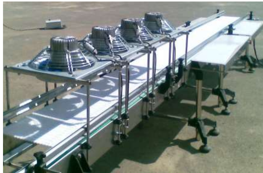
The wide width Conveyor equipped with drier fan

- The conveyor body has been enforced by tick stainless steel plates where driving system has been installed.