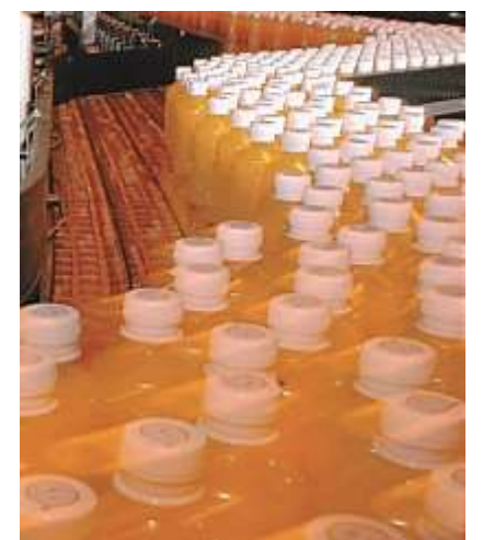
Storage conveying system