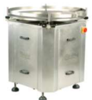
Container Storage round desk system